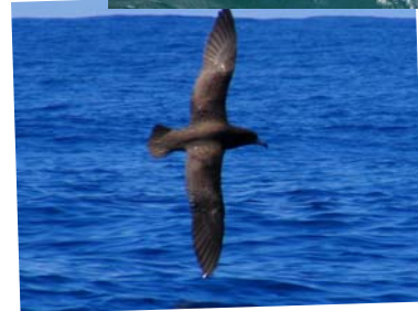
Black-winged Petrel, Immature Wandering Albatross, Flesh-footed Shearwater.